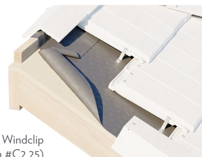
2-1/4" Sidelock Windclip (Item #C2.25)